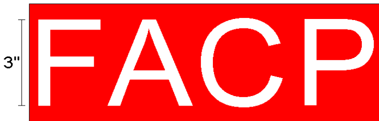
1/2" Letter Stroke