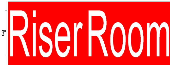
1/2" Letter Stroke